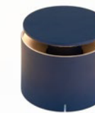
LD1050Y3 Steel Blue