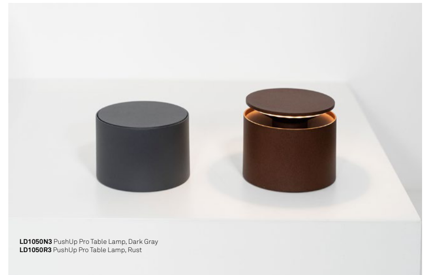
LD1050N3 PushUp Pro Table Lamp, Dark Gray LD1050R3 PushUp Pro Table Lamp, Rust