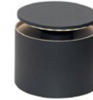
LD1050N3 Dark Gray